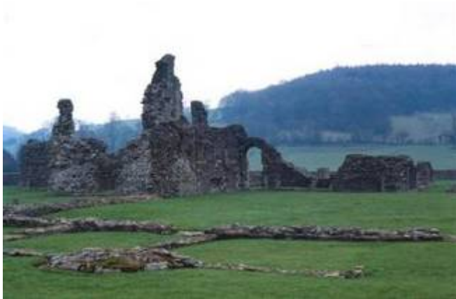
General View

The remains of a Cistercian abbey founded in 1148, set on the banks of the Ribble against a backdrop of dramatic hills. After its dissolution in 1536, the monks were briefly returned to the abbey during the Pilgrimage of Grace. They remained in possession until the insurrection's collapse and the execution of their abbot.